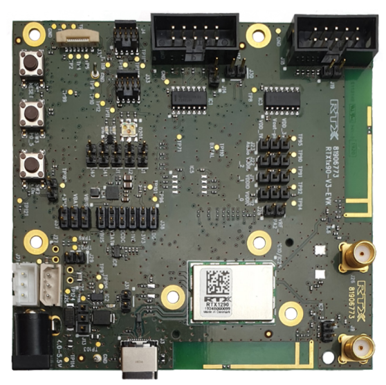
Figure 3: RTX1x90EVK mounted with RTX1290